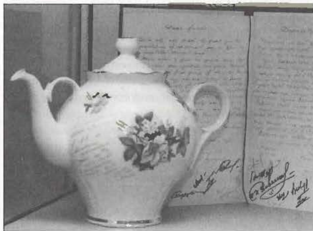
In November 1988 the Moscow Beginners Group—the first A.A. group in Russia—sent this lovely teapot to G.S.O. It is displayed in a glass case in G.S.O.'s Archives in front of a statement of appreciation and gratitude (in both English and Russian) with signatures of group members.